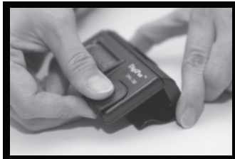
Push down the battery cover to slide open.