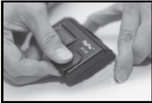
Push down the battery cover to slide open.