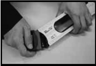
Open the rubber protector