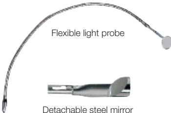
Flexible light probe