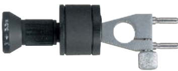
Focusable prism telescope