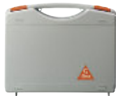
Case for HR and HRP Binocular Loupes