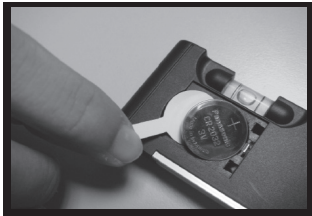
For the first time usage, remove the plastic strip to connect the battery