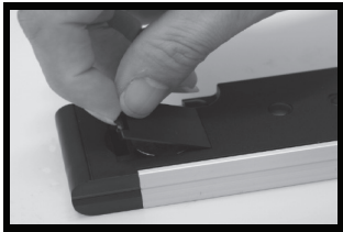
Remove the battery cover.