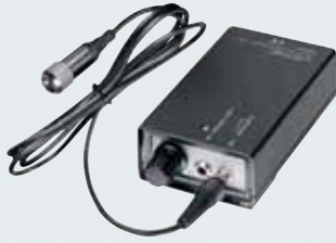
Accubox I with Connecting Cord