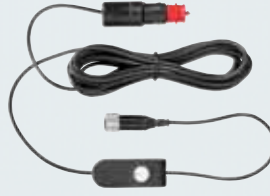
Connecting Cord for Cigarette Lighter Socket