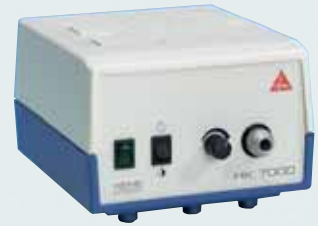
HK 7000 F.O. Projector