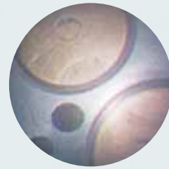
HEINE SF 6 Endoscope with 7400 Single fibres