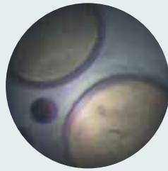
Conventional Endoscope with 3500 Single fibres