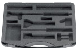
Transport and Storage case for T-523 Inspection-Set "Compact"