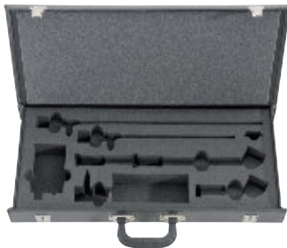
Transport and Storage case for RW6 Endoscopes