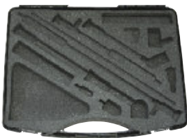
Transport and Storage case for long Endoscopes and for Building Inspector's Set and Automobile Inspection Set