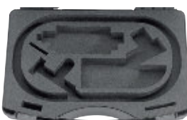
Transport and Storage case for flexible Endoscopes SF/SFM