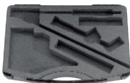
Transport and Storage case for short and medium-length Endoscope